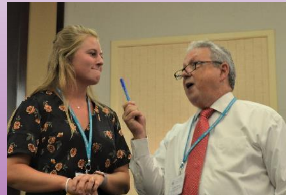
Fund Raisers ~$6,000