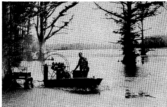
Figure 2. Strip treatment application of diquat-potassium endothall to control the growth of elodea in Chickahominy Reservoir, a source of municipal water.

Elodea infestations were reduced enough that boat passage was possible in all major fishing lanes and areas on the eleventh day following final application. Erratic chemical drift and elodea control was experienced on a short term basis in the almost non-flowing side streams. Partial clearance in treated lanes and areas, enough to allow free