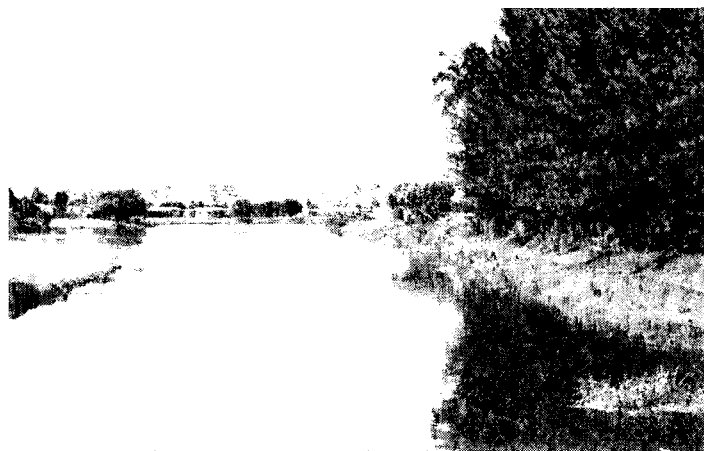
Figure 2. A small lake at time of treatment (top) and the same lake 3 months after treatment with 1 ppmw of diquat plus 4 ppmw of copper sulfate for control of hydrilla.