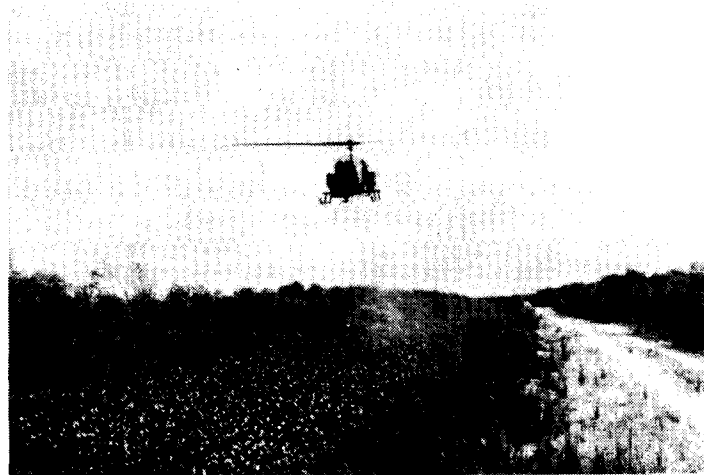
Figure 3. Application of an invert emulsion on water hyacinth by means of spinning disk.

We made the following invert emulsion treatments: the butoxyethanol ester of 2,4-D at 4 lb/A; 2,4-D emulsifiable