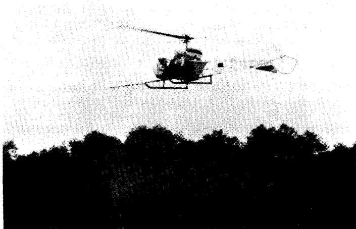
Figure 2. Application of an invert emulsion with the bifluid system.

retreated on August 24 in the same way as for the original applications. Two additional treatments were initiated on August 24 testing silvex at 8 lb/A in total spray volumes of 12 gpa and 17.4 gpa.