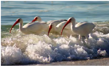
Local residents of Sanibel

Another full day trip lies 30 miles northwest of the Hyatt on Sanibel and Captiva Islands. Tour the lighthouse grounds on the south end of Sanibel, and then drive north to Ding Darling National Wildlife Reserve on central Sanibel to see roseate spoonbills and alligators. Afterwards, complete the drive north to the end of Captiva Island where you will find several restaurants, open-air cafes and the opulent Seven Seas Plantation. Shelling is still spectacular along the beaches from Captiva to Naples. Fishing is also World Class especially in Charlotte Harbor to the north, and Pine Island Sound between Sanibel-Captiva and the mainland. Tarpon average around 100 pounds and locals attest that snook season reaches its peak around the full moon of June. My daughter and I have our best success catching snook at night on an incoming tide in the bays and estuaries. The January 2010 freezes had quite an impact on tarpon and snook so fishing for these is catch and release only this summer. I recommend you contact one of the many guide services in the area to assess current conditions.