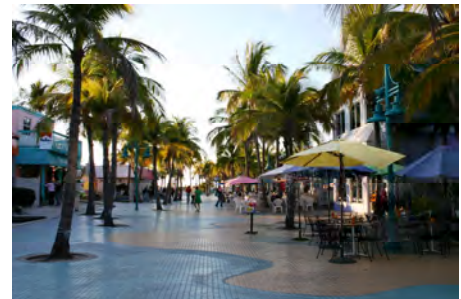
After a day at Ft. Myers Beach dine casually at the end of the pier.

While you are in Florida, why not plan a family vacation either before or after the conference? There is plenty to see and do in southwest Florida; the crowds are lowest this time of year; and Florida could use the economic boost. There are many websites to help you plan your journey including: day trips or several-day excursions, shopping, history and museums, parks, beaches, and boat trips. My family ties and visits to the area began in 1960 (not to attend the Hyacinth Control Society – my first meeting was Chattanooga in 1979). Although I live 400 miles north in Tallahassee, I visit southwest Florida 4-5 times each year and still find new adventures on every trip. I have listed a few ideas from my visits along with approximate mileages from the Hyatt Regency Coconut Point Hotel - which by the way is 15 miles from the Southwest Florida International Airport. If you want ideas from a full-time resident, consider contacting Don Doggett with the Lee County Hyacinth Control District.