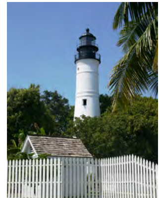
Key West lighthouse

If you would rather sit back and observe while others drive, there are numerous airboat and swamp buggy tours - from Babcock Wilderness 50 miles to the north, to the Everglades National Park to the south. For the ultimate day trip, consider the high speed catamaran that commutes daily between Ft. Myers Beach (and Marco Island) and Key West. The boat leaves the dock and Ft. Myers' famous fishing fleet at 8:00am for the 3.5-hour journey to Duval and Caroline Streets. The five hour layover allows time to enjoy the sites, food, and beverages before catching the 6:00pm return cat. Climbing the Key West Lighthouse, a photo at the Southernmost Point of the Continental USA, and rehydrating at Sloppy Joes or Captain Tony's are favorites among visitors. Increase your touring efficiency by hopping the Conch Train or one of the many pedicabs, or stay a day or two, take in a sunset at Mallory Square, and hang out with the locals.