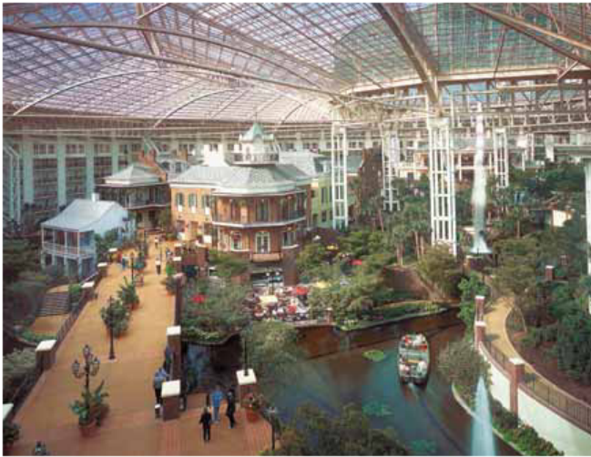
Gaylord Opryland Resort, Nashville, TN